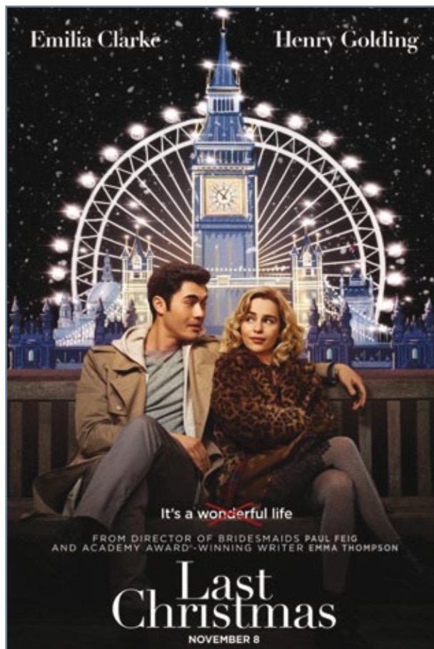
Film Poster

Emma Thompson is known for being an activist, and so it may come as no surprise that this is a more dramatic type of romantic comedy, that also deals with some more emotional topics along the way. Family, illness, homelessness, immigrants and generally people trying to repair their lives are running themes throughout the film.