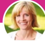
Dayity PIN: 3467

Pick from our many talented psychics, all with different techniques