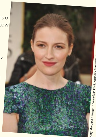
Kelly Macdonald Image - Featurefish Photo Agency / Shutterstock.com

To see the trailer: http://sonyclassics.com/puzzle/